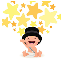
New Year's Day - 1/1