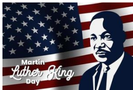
MLK Day - 1/15