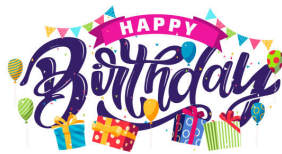
Raymond Machado- 1/10 Cindy Machado- 1/18